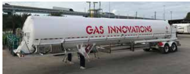
D.O.T. Cryogenic Transport Ethane, Ethylene & LNG