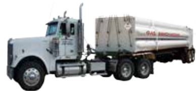
D.O.T. 3AAX MODEL