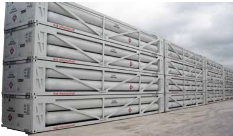
Large fleet of assets for your job requirements