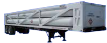
D.O.T. 3T MODEL