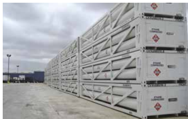
MEGC / ISO High Pressure Tube Modules