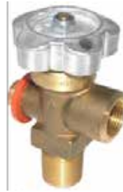
CGA 510 Diaphragm Valve (Repressurization model also available)