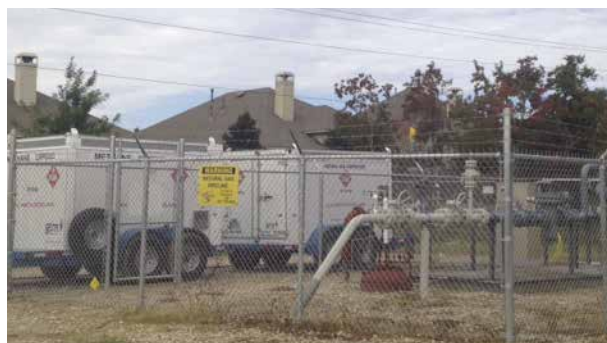
Residential utility pipeline support