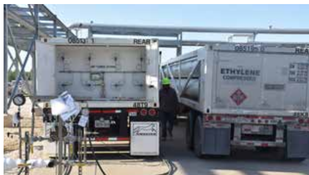
Turnkey supply for pipeline curtailment