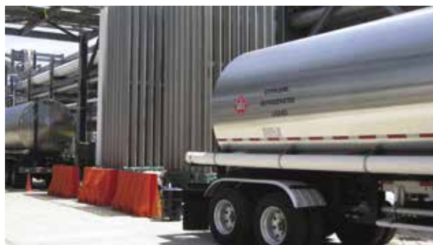
Interim gas flow outages utilizing 2-80 K vaporizers