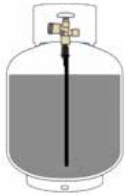
Liquid Withdrawal (Dip Tube / Syphon Tube)

Gas Innovations low pressure cylinders are free of any residual oil & particulate that accumulates during the cylinder manufacturing process. Cylinders are available in a variety of sizes for both liquid and vapor withdrawal applications. Each cylinder package is equipped with a CGA 510 diaphragm valve preventing contamination during vacuum / fill procedures. Cylinders are refillable and D.O.T. compliant.