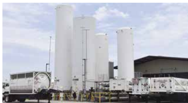
Hydrocarbon Storage Facility