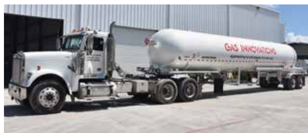
LP Transports Propane, Isobutane, Propylene & Butane