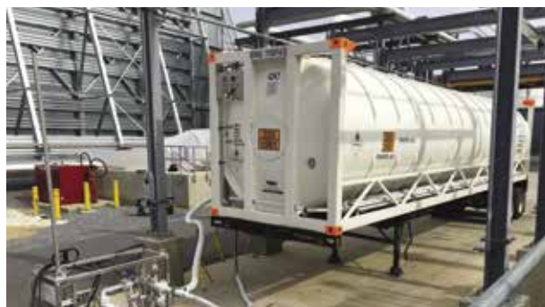
Innovative offloading designs