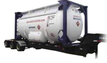
Low Pressure & Cryogenic ISO Containers

Carbon Monoxide 99.0% to 99.99% + CNG / LNG 94.0% + Ethane 99.0% to 99.5% Ethylene 99.0% to 99.95% HCL Anhydrous 99.0% to 99.999% Methane 99.0% to 99.999%