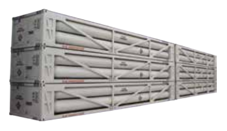
ISO Tube Modules