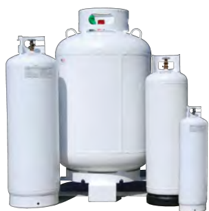
LOW PRESSURE CYLINDER PACKAGING