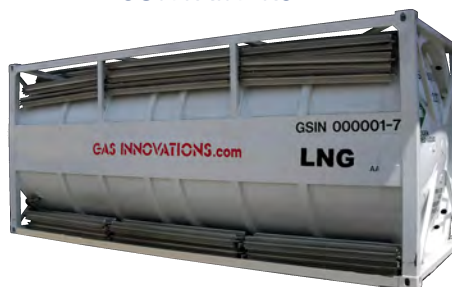
CRYOGENIC (ALSO AVAILABLE FOR LP GASES)