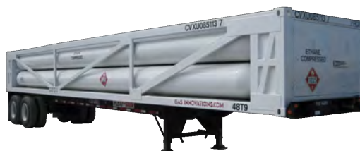
COMPRESSED HIGH PRESSURE