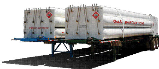
COMPRESSED GAS MODULES