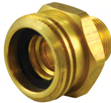
TRAILER HOSE CONNECTION 1 3/4 ACME