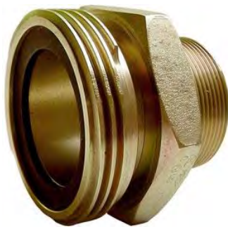
TRAILER HOSE CONNECTION 3 1/4 ACME

Trailer Fill Port & Hose Connections for PROPANE, PROPYLENE, ISOBUTANE, BUTANE