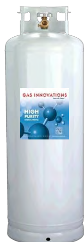
LP 239 Cylinder