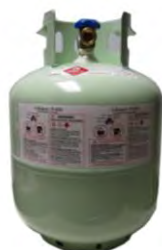
LP 5 Cylinder