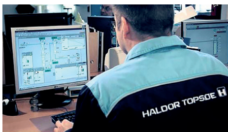
Remote monitoring and operation by Haldor Topsoe's personnel provides peace of mind.

At the cathode, CO 2 dissociates to form CO and O 2 . The oxygen atom reacts with the incoming electrons from the external circuit to form an oxygen ion. The oxygen